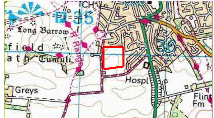
Contains Ordnance Survey data © Crown copyright and database right 2018