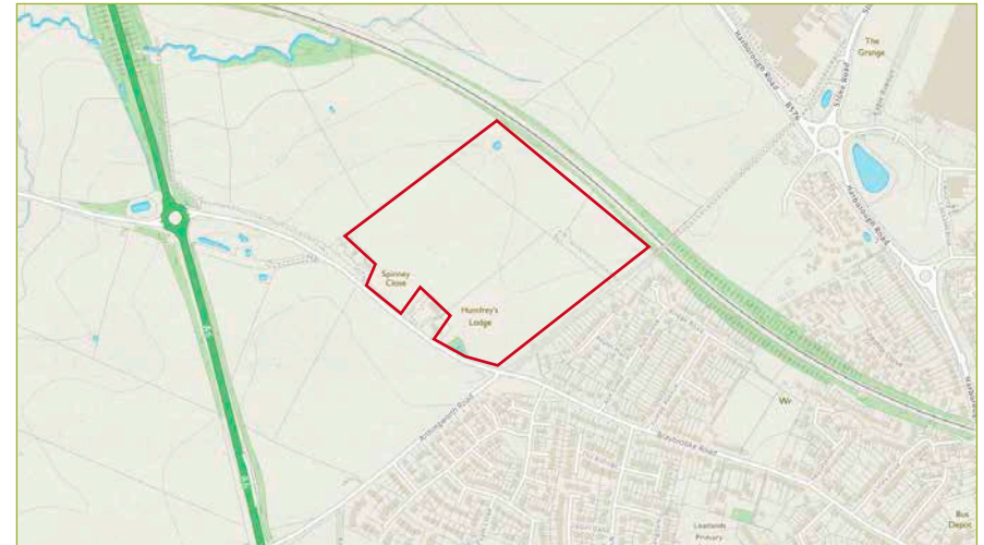
Contains Ordnance Survey data © Crown copyright and database right 2017